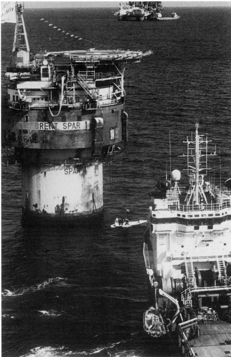
1. On 30 April 1996, a dozen Greenpeace activists occupied a defunct oil rig, the Brent Spar, 120 miles off the coast of the Shetland Isles in the North Sea. The occupation was staged in protest of Shell Oil's plans to tow the rig into the Atlantic and dump it in deep water.

On 30 April 1996, a dozen Greenpeace 4 activists occupied a defunct oil rig, the Brent Spar, 120 miles off the coast of the Shetland Isles in the North Sea. They were there to protest Shell Oil's plans to tow the rig out into the Atlantic in order to dump it in deep water. Once onboard, they unfurled a banner displaying the slogan "Save Our Seas." The piquant contrast between the physical