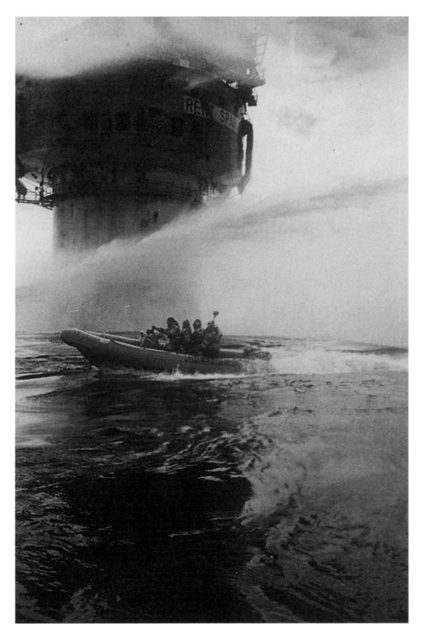
3. A Shell Oil vessel attacks Greenpeace activists with water cannons. Despite such dangers, activists stayed aboard the rig as it was towed over 330 miles out into the Atlantic.

a "film set" made the "art" in this protest especially visible—a spectacle for our times. The sometimes extreme dangers in the "art" of such Greenpeace protests have often dominated the angle of media attention, the daring-do of these "stunts" framed as outlandish circus: an image constantly countered by claims that its activists are highly trained and well-equipped (Durland 1987 [1998]:67–73). Such attention to the performative excesses of events is the price usually paid in any struggle for media dominance, and it is one that also comes with unfortunate side effects for the ecological message of the protest. While the protesters may prefer the "art" of their actions to be invisible, so that the message predom-