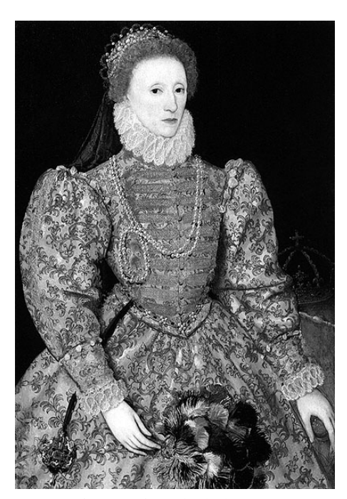
(unknown artist), Elizabeth I , c.1575 (National Portrait Gallery, London)

Byatt corresponds to the varieties of hues, the richness of detail and the preciousness of ornament, through which the painter renders the supreme polish of the queenly figure, with an ekphrasis made of overabundant adjectives and symmetrical verbal constructions. "Embroidered with golden fronds, laced with