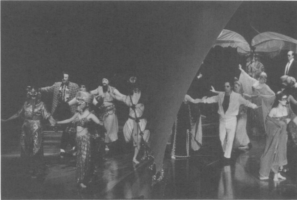
Figure 3. From the second carnival, with the scrim visible. Guthrie Theatre production of The Rover .

one moment and they will be excluded by stone-faced celebrants brushing by them the next. For those in the cast as well as those who had paid to be present, individuality could not be preserved during participation in the group and, at the same time, there was no guarantee of inclusion. 35 These festal communities were, in other words, both desirable and unattainable.