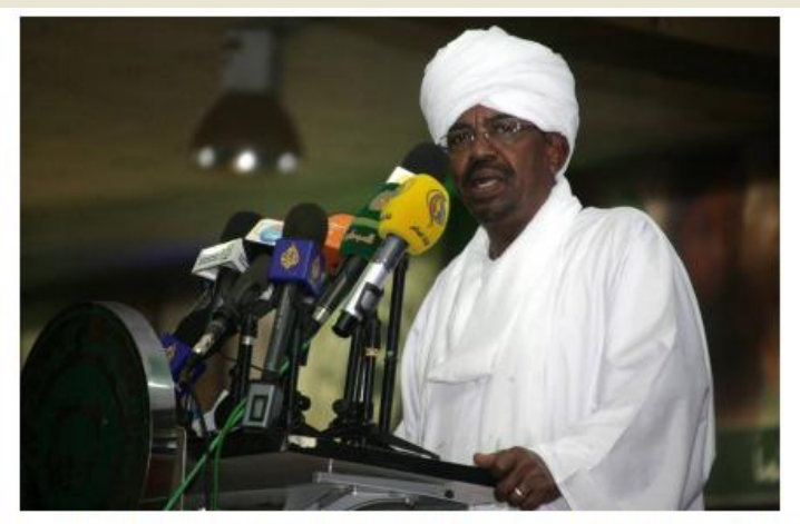
President Omar al-Bashir in Khartoum, Sudan, 2015.

South Africa, Gambia and Burundi want to withdraw from ICC