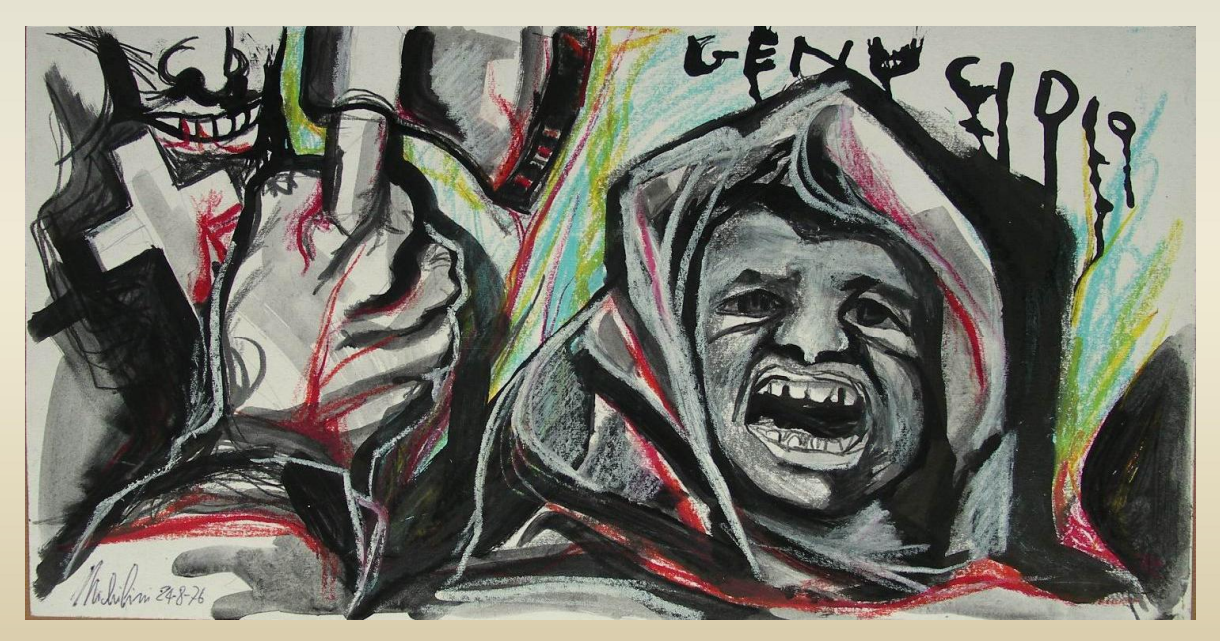
(S. MICHILINI, Genocidio, 1976)

The intentional action to destroy a people, in whole or in part.