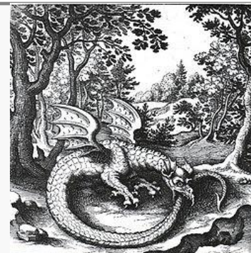
Ouroboros from Lucas Jennis: De Lapide Philosophico*

Non-oxidative processes [Pd(II)] that stays Pd(II)